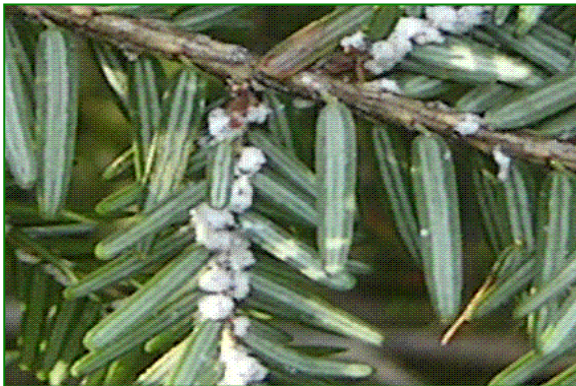
Look for white cottony masses on the undersides of branches