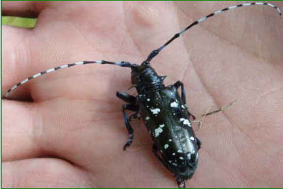
Adult Asian Longhorned Beetle. Actual size is 1 to 1.5 inches.