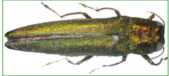
Adult Emerald Ash Borer. Actual size is 3/10 to 1/2 inches.