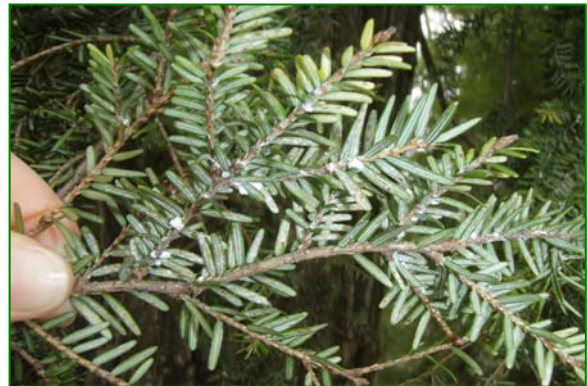
Hemlock tree infested with Elongate Hemlock Scale and Hemlock Woolly Adelgid

Hemlock Woolly Adelgid and Elongate Hemlock Scale are exotic insects new to NH and infest hemlock trees. They can be found individually or together on the same tree. These insects have caused extensive tree mortality in other states. We need your help to save the hemlock resource in our state.