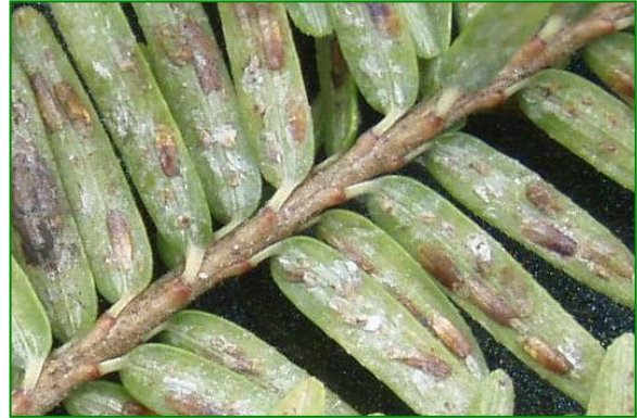
Hemlock tree infested with Elongate Hemlock Scale