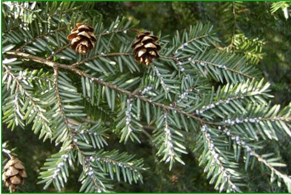
Hemlock tree infested with Hemlock Woolly Adelgid