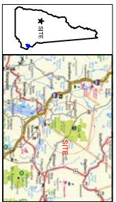
LOCATION MAP SOURCE: NEW HAMPSHIRE MAP SERVICE